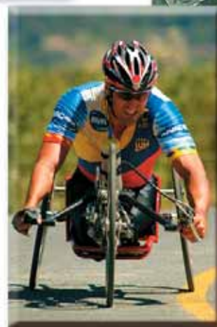
Professional athlete pictured. Do not attempt this maneuver.